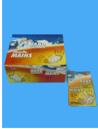
GRABBER HAND WARMERS 40 PR/BX HWHW