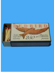
EDDYLITE WOOD MATCHES 24/10/30/CS MA498204