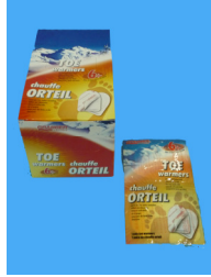
GRABBER TOE WARMERS 40 PR/BX HWTW