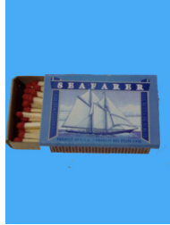
EDDYLITE WOOD MATCHES 24/2/250/CS MA498253