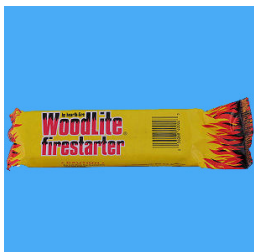
WOODLITE FIRESTARTERS 12/6/80Z FLWOODLITE