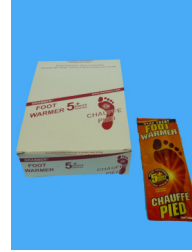
GRABBER SMALL/MEDIUM FOOT WARMER INSOLE 30 PR/BX HWFBSM