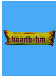
HEARTHFIRE 3 HOUR FIRELOG 6/CS FLHF3