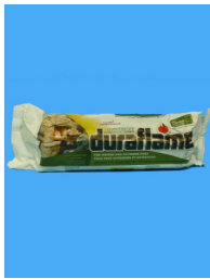
DURAFLAME 2 HOUR FIRELOG MADE WITH 100% RENEWABLE RESOURCES 6/CS FLDURA2