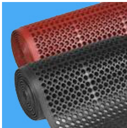
562 SANITOP BLACK, RED