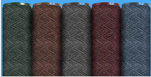
105 CHEVRON HUNTER GREEN, SLATE BLUE, CHARCOAL, BURGUNDY, BROWN